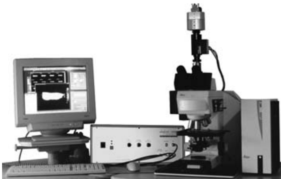
Fig. 1. The Lambert Instruments FLIM system